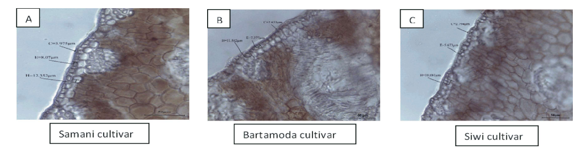
Fig. 3: (A) - Cross section of a palm leaf of the Samani cultivar (B)- Cross section of a palm leaf of the Bartamodacultivar (C)- Cross section of a palm leaf of the Siwi cultivar * C= Cuticle, E =Epidermis and H= Hypodermis